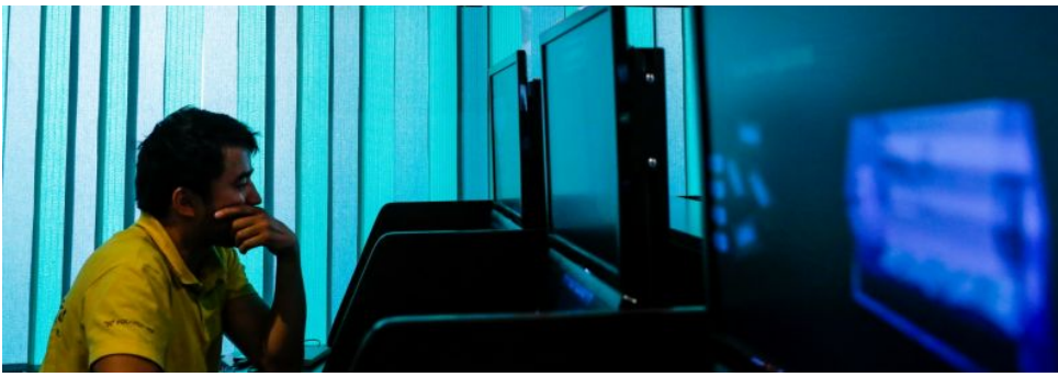
A computer screen shows the 2018 FIFA World Cup emblem in a Moscow branch of Liga Stavok, one of the leading Russian betting companies.