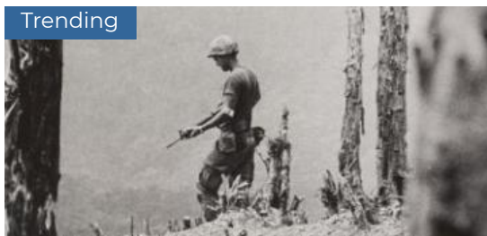
UPI Pulitzer Prizes: The stories behind the pictures and words