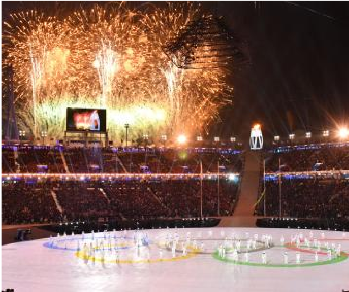
2018 Winter Olympics closing ceremony